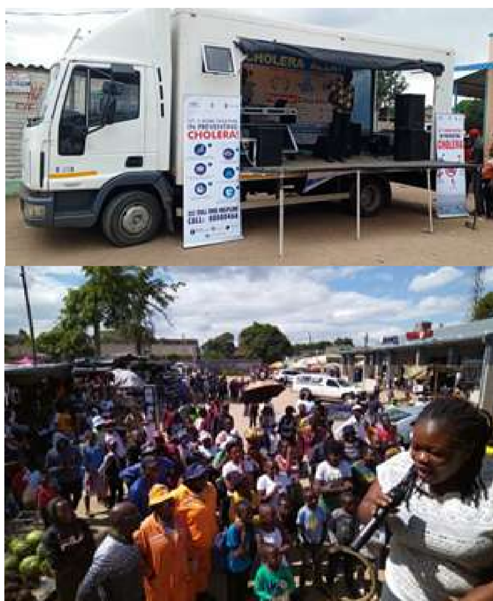
Communities and Children receiving information on safe hygiene practices to prevent cholera during road shows.

In April the, ZCC with support from the Ministry of Hhealth and Child care (MOHCC) continued to raise awareness among communities and interfaith leaders on cholera prevention through capacity-building workshops and awareness campaigns in Gwanda, Chitungwiza and Epworth. In addition, the ZCC has capacitated 120 health care workers in new hotspot areas on case management. The ZCC also distributed NFIs (soap) during road shows to encourage handwashing. These efforts are expected to complement government efforts towards reducing the morbidity and mortality associated with the Cholera epidemic in Zimbabwe.