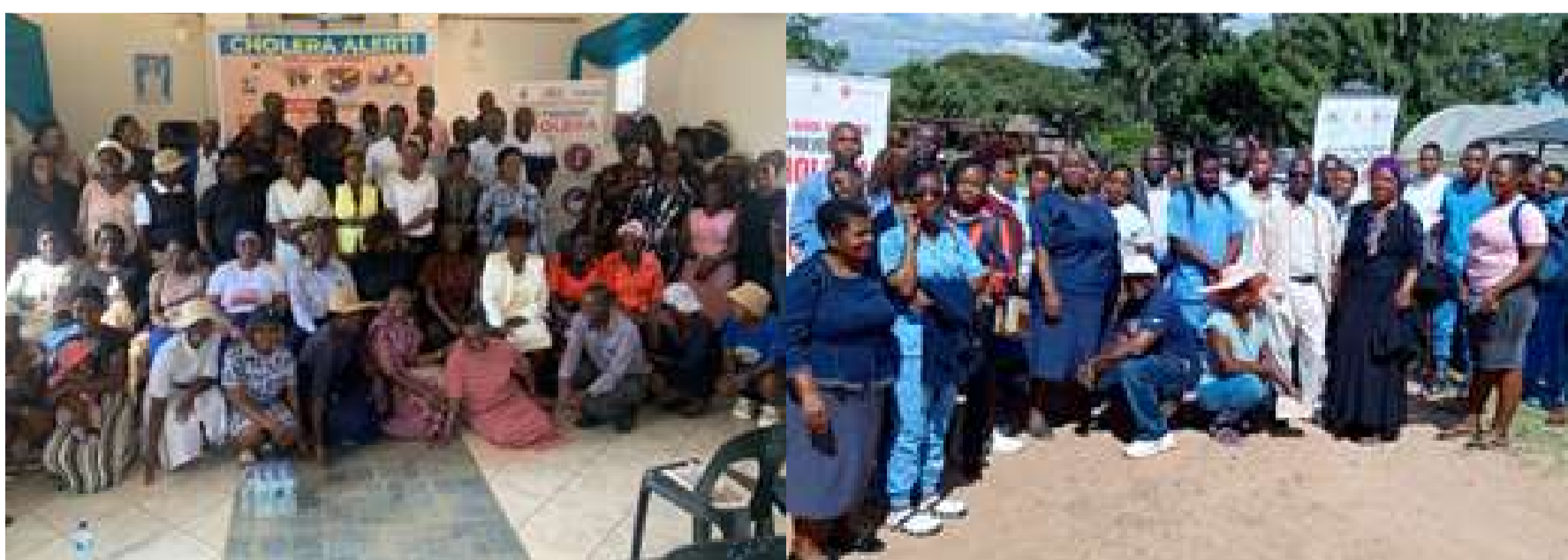
Inter faith leaders and health care workers capacitated on proper health and hygiene practices as well as case management.