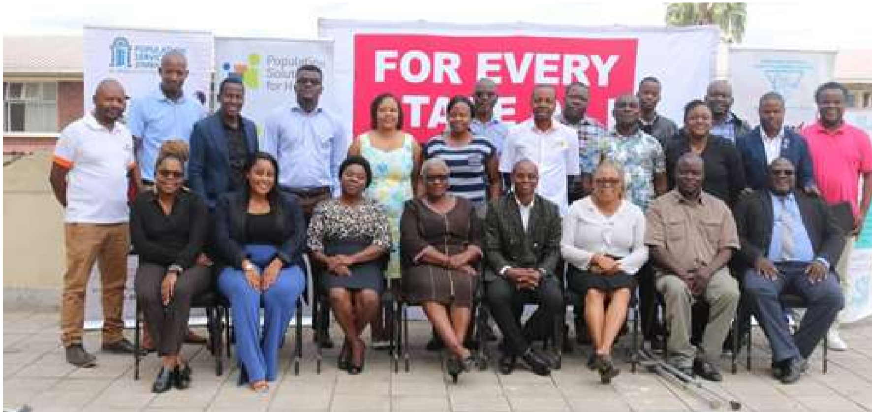
The various stakeholders who participated in a 3-day Smart Advocacy workshop held at Holiday Inn, Harare.