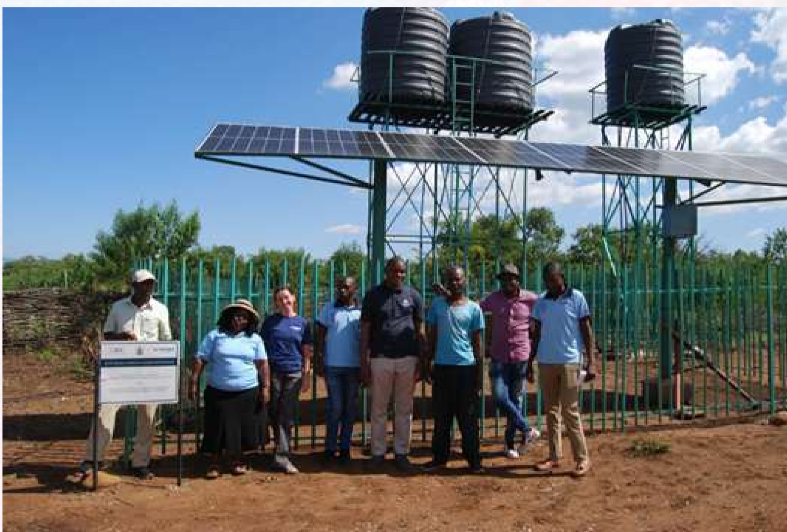
Australian Embassy, ACT for Peace and ZCC Humanitarian Services and Diakonia Director, ZCC staff, Government stakeholders and community members pose in front of the recently completed Solar Powered Piped Water Scheme.

In April the Australian Embassy and Act for Peace, toured Runyararo settlement to witness the work being done by their partner ZCC in collaboration with Government of Zimbabwe under the Strengthening Protection and Resilience project. Through the generous support of the Australian Government and Australian churches, the program is helping to improve lives among communities in and around the Runyararo settlement in ward 7 Chimanimani through the provision of clean and safe water, hygiene information, strengthening protection and catalyzing small businesses to improve incomes. Government established the Runyararo settlement to accommodate households displaced by Cyclone IDAI in Chimanimani district. So far more than 400 households have been resettled in the area.