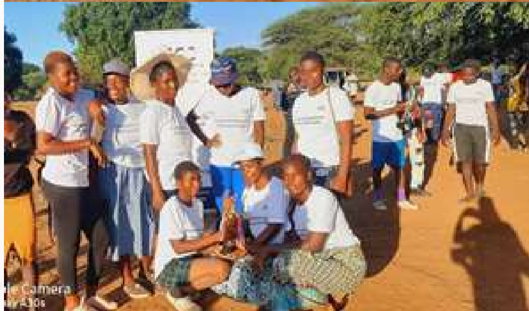
The netball and soccer teams from the three different wards participating in the Sports for Peace tournament in Chipinge district.