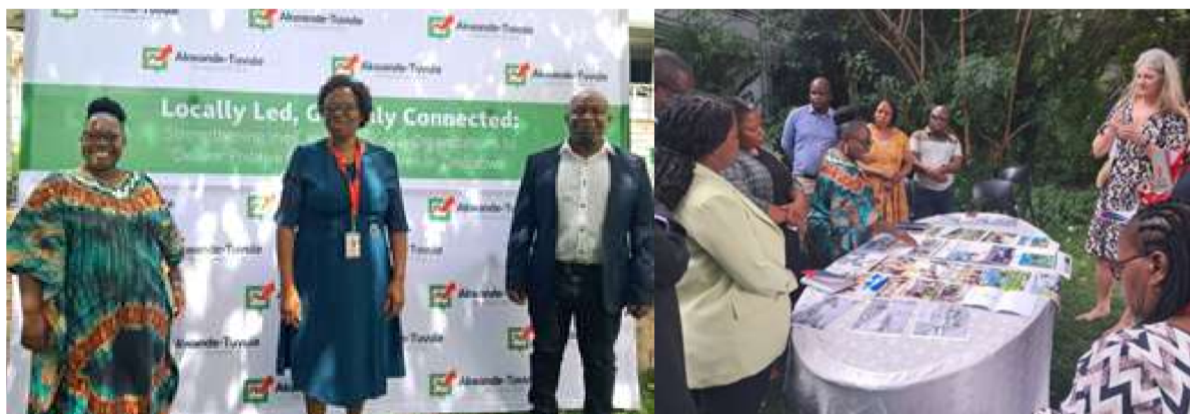
The ZCC HSD Director describing the work of the Development Hub to International partners during the partner exhibitions.

On the 9th of April the Zimbabwe Council of Churches participated in the Akwande-Tuvule Development Hub partners workshop in Harare which was hosted by Save the Children Zimbabwe. The Akwande-Tuvule Development Hub, which comprises of 20 local & national organizations, was recently launched by Save the Children in Zimbabwe as part of its localization agenda. The localization agenda aims to shift power to local partners, children and communities. . During the workshop, the ZCC and 20 other local partners shared on how their work is positively changing the lives of children. Furthermore, the workshop created a platform for Save the Children and local partners to collaboratively strategize on the future of the development hub. The Akwande-Tuvule Development Hub, which comprises of 20 local & national organizations, was recently launched by Save the Children in Zimbabwe as part of its localization agenda. The localization agenda aims to shift power to local partners, children and communities.