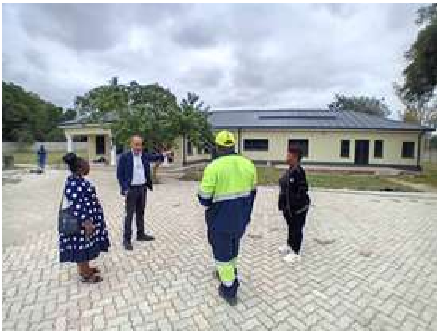
The ZCC, UK Home Office, and the Building Contractor assessing progress made in constructing the reintegration shelter conducting a site assessment.