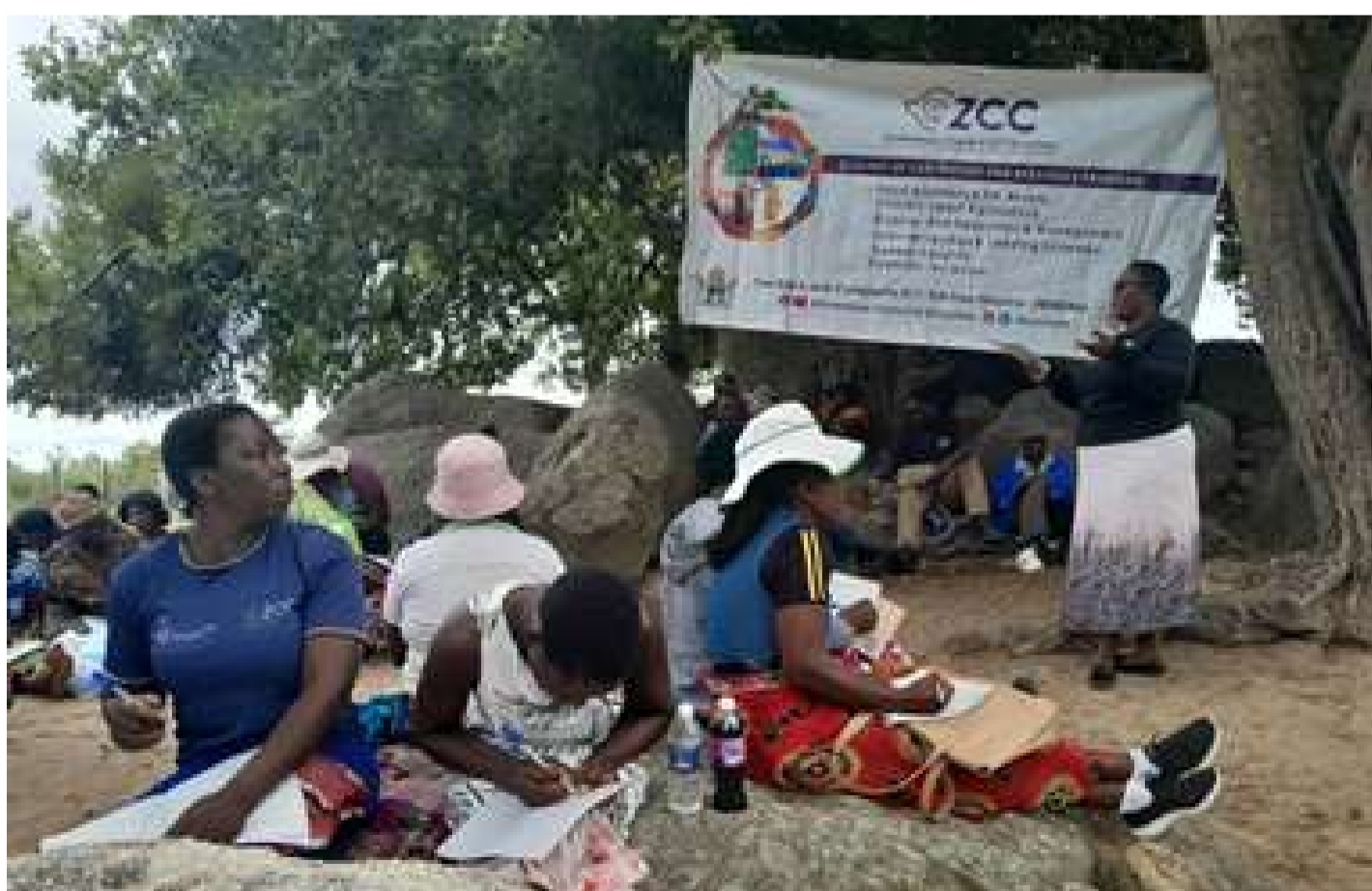
ISAL groups undergoing refresher trainings in Zvishavane district