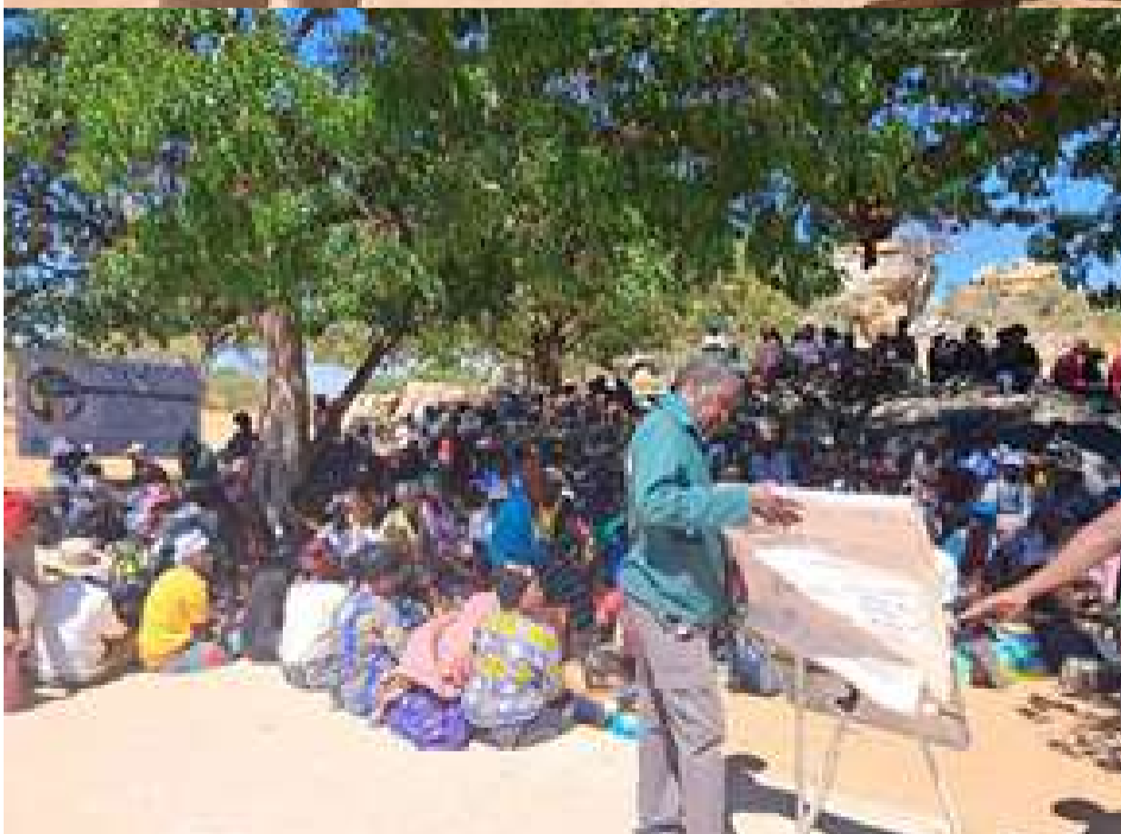
The Agritex AEO facilitating training exercise in Gwanda district on post-harvest handling.