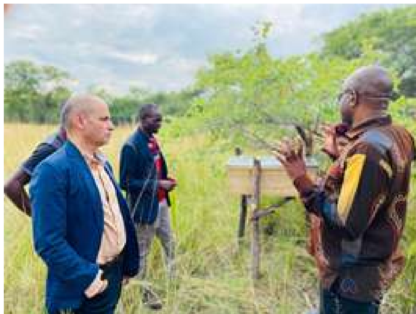
The ZCC Secretary General chats with and UK Home Office, assessing progress made at the during a visit to a client who is running an apiculture project enterprise in Mbondoro