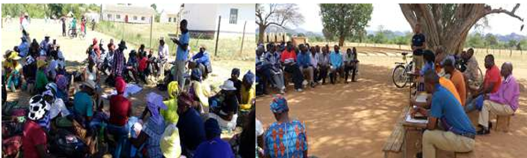
The ZCC, Government stakeholders and University research specialist conduct focus groups discussions FGDs in Bikita and Gutu district during the situational assessment exercise.

On the 16th to 20th of April the Zimbabwe Council of Churches (ZCC) with support from the Canadian Food Grains Bank (CFGB) and United Church of Canada (UCC) conducted a situational assessment in Gutu and Bikita districts in an effort to identify existing community needs and vulnerabilities as well as the expected mitigatory and adaptive actions. This situational assessment is expected to inform future programming in the districts and ensure that all response efforts directly address existing community needs such as drought and hunger.