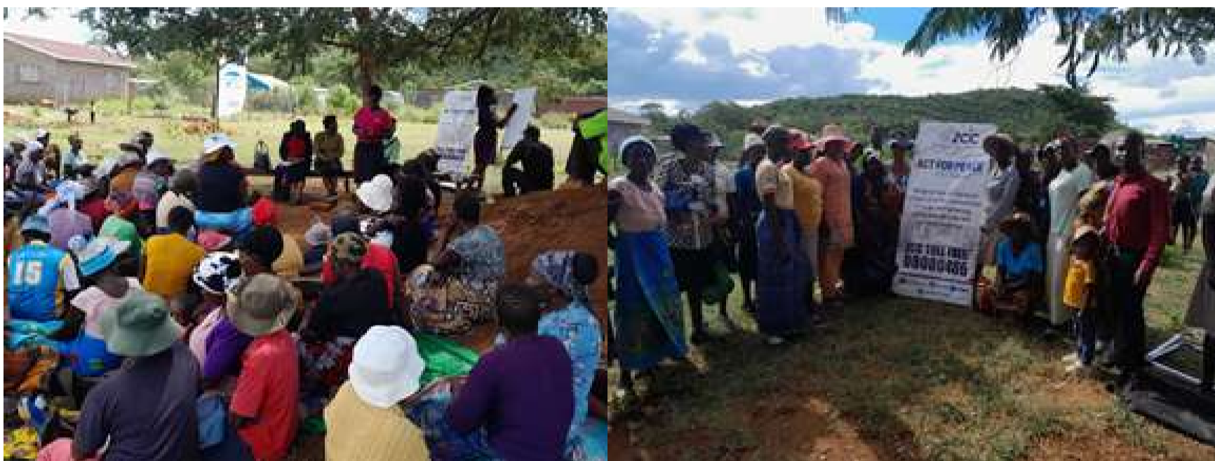
Community members participating in disaster risk mapping exercise.