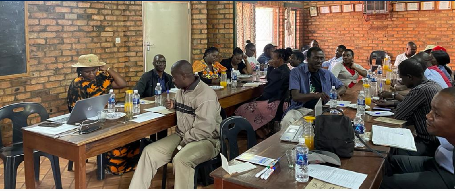
Participants during the training on Policy Analysis and advocacy

The Zimbabwe Council of Churches in partnership with other members of the Zimbabwe Heads of Christian Denomination (ZHOCD) recently organized a Provincial Training of Trainers on Policy Analysis and Advocacy in Masvingo and Matabeleland North Provinces aimed at enhancing the participation of communities to partake in issues that affect them both at the local and national levels.