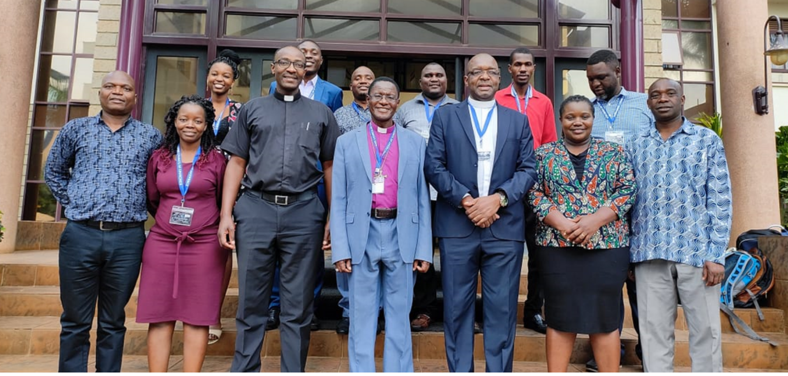
ZCC delegation with the National Council of Churches in Kenya (NCCK) during a learning visit

Zimbabwe Council of Churches (ZCC) has played a significant role in the country's Long and Short-term electoral processes that took place on the 23rd and 24th of August. From voter education to election observation, ZCC strived to guaranty a peaceful electoral environment in Zimbabwe.