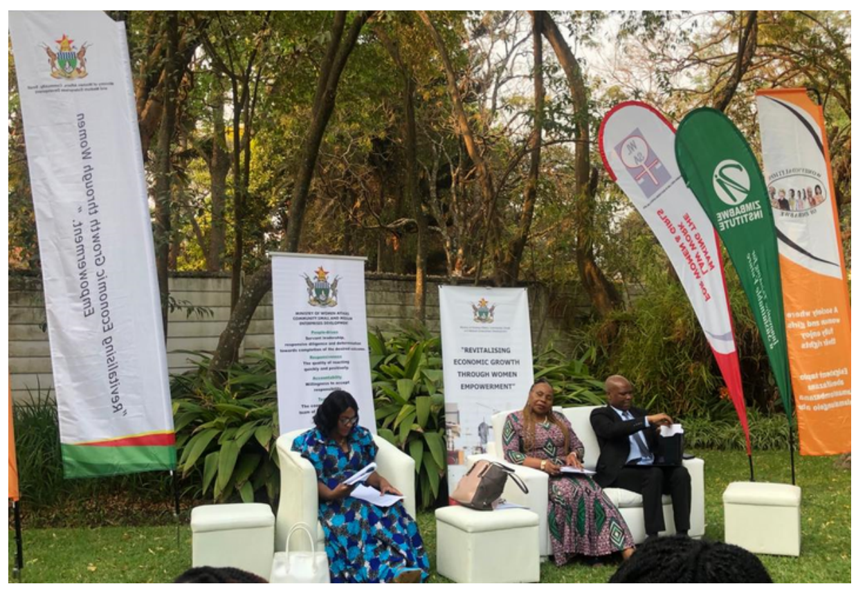
Honorable Monica Mutsvangwa (centre) during the Meet and Greet in Harare, Zimbabwe

The Zimbabwe Council of Churches (ZCC) recently engaged in a Meet. The Meet and Greet meeting with Minister Monica Mutsvangwa and Greet meeting with the esteemed Minister of Women Affairs, Honorable Monica Mutsvangwa, on the 28th of September 2023. This significant gathering provided a platform for both parties to share a common vision of promoting women's active involvement in politics and leadership roles within the country.